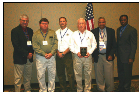
Natchitoches Airport officials were presented with the Louisiana Airport of the Year Award.

The City of Natchitoches and Natchitoches Regional Airport received the Outstanding